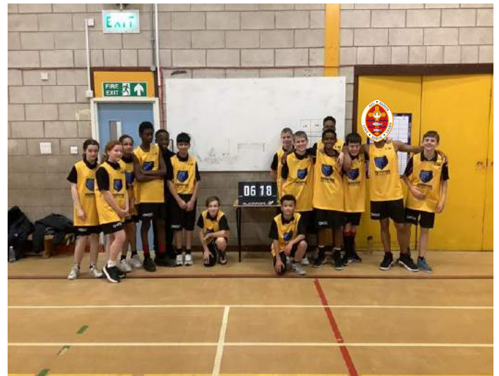
Year 7/8 Jnr NBA Basketball Team