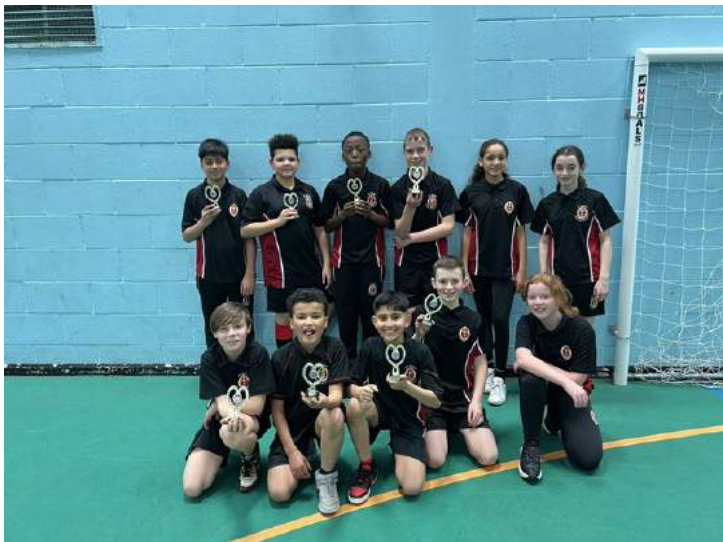
Year 7 Basketball Tournament