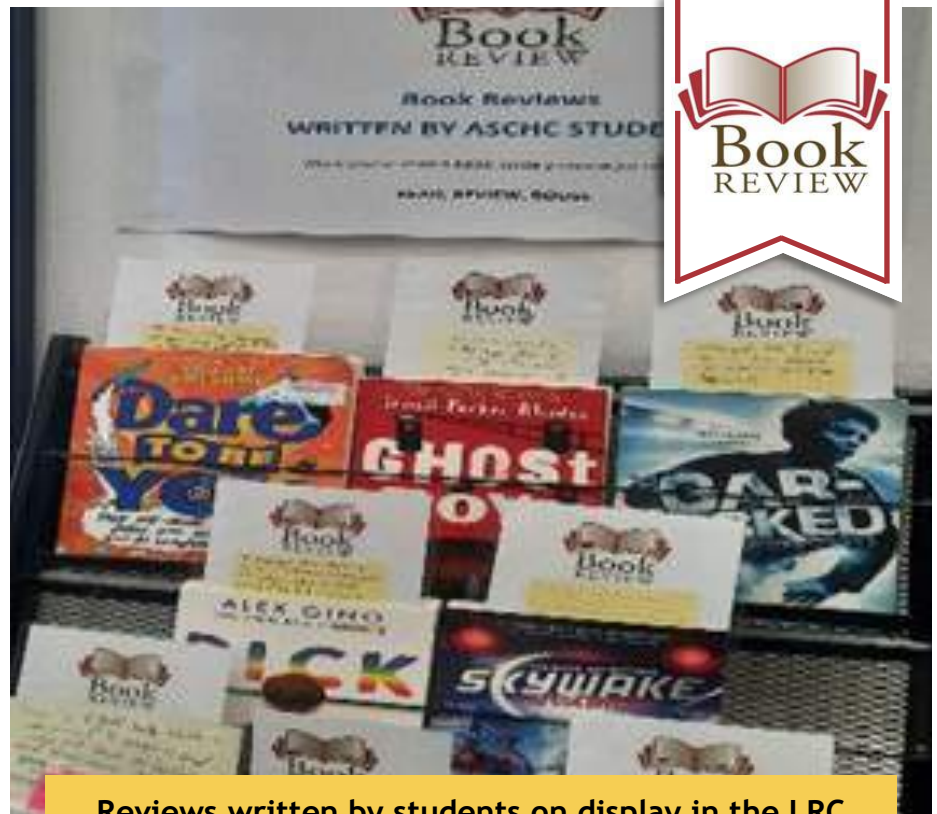
Reviews written by students on display in the LRC

The ASCHC Learning Resource Centre (LRC) has been fully open since September welcoming students at break and lunchtime, allowing them to read, complete homework or take part in social activities.