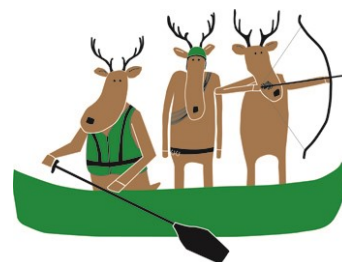
Little Deer Wood